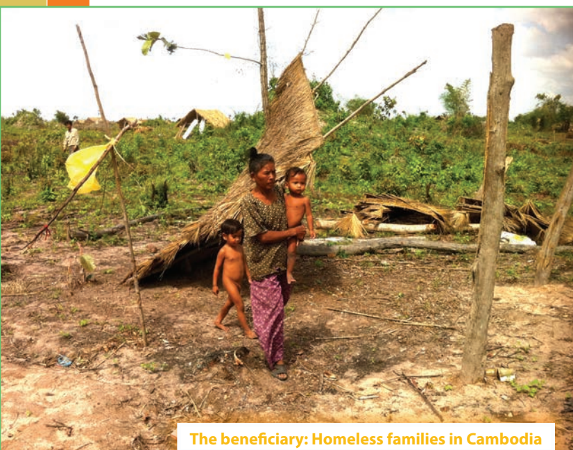
The beneficiary: Homeless families in Cambodia

IWFCIS SimplyHer Xtraordinary Women 2012